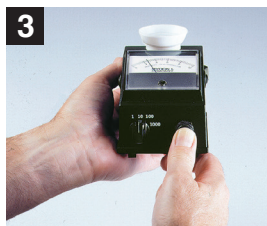
Push button to indicate reading