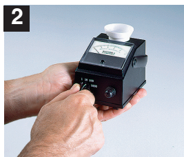
Select Conductivity/TDS range