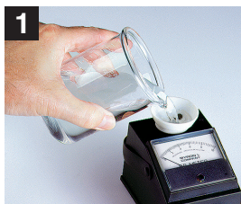
Rinse and fill cell cup